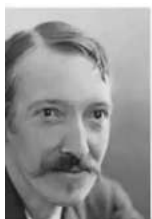
Robert Louis Steve

Stevenson recognized the transformative qualities of silence. He believed that true growth and self-discovery occur in moments of quiet reflection. In his essay "Walking Tours," he wrote, "Silence, they say, is the voice of compunction; but silence is rather the company of innocence; and our blank mornings are incapable of a dishonorable thought."